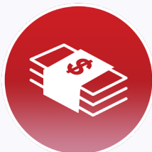
Central Credit Unit (CCU)

Omni EYE is supported by a 24/7 Help Desk and team of skilled field technicians ensuring you have all the support you need.