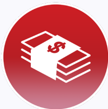
Central Credit Unit (CCU)

Omni EYE is supported by a 24/7 Help Desk and team of skilled field technicians ensuring you have all the support you need.